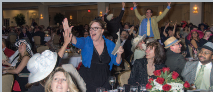
The crowd cheers as "Saskatchewan Bully" wins the race.