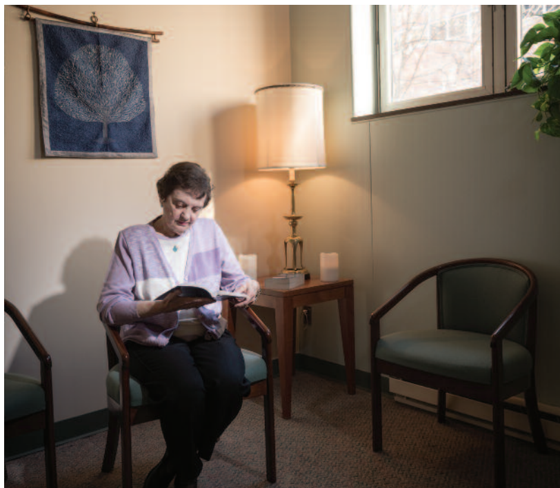
For the spiritual comfort of staff and visitors, Riddle recently redesigned its interfaith Prayer Room.